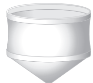
Previous plunger design

A newly designed plunger system is more efficient, reducing waste.