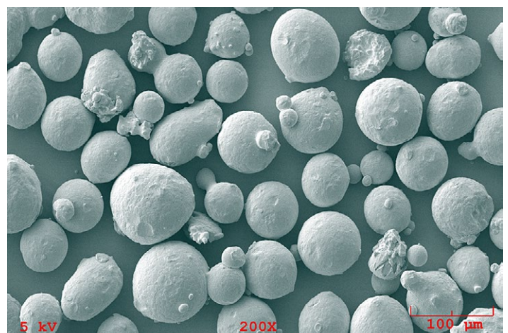
Mechanically Clad (top), Gas Atomized (bottom)