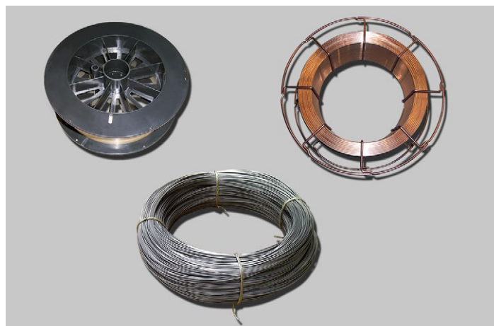
Top: Typical spheroidal morphology for powder products: Bottom: Packaging availability for Metco Copper..