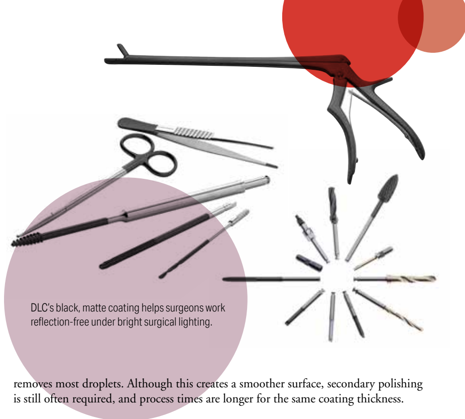
DLC's black, matte coating helps surgeons work reflection-free under bright surgical lighting.

Some hydrogen-free DLCs are produced using a filtered cathodic arc deposition method, in which an electromagnetic filter