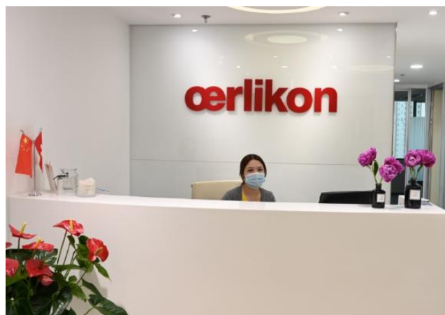
Caption: This building is now home to the employees of Oerlikon's Manmade Fibers segment: The Place, Tower A, 100 Zunyi Road, Changning District, Shanghai China 200051.