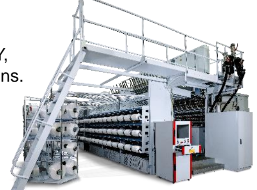
New eAFK Evo