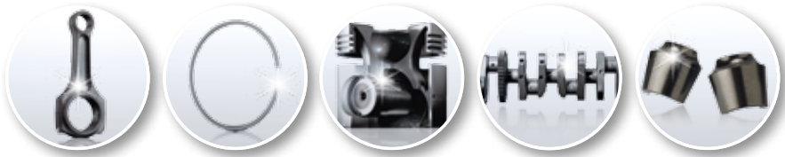
Connecting rods / Piston rings / Piston pins / Crankshafts / Sockets