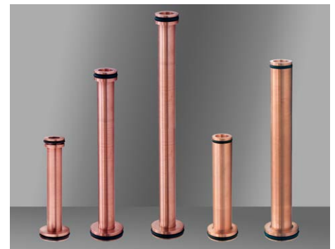
In stock and ready to ship