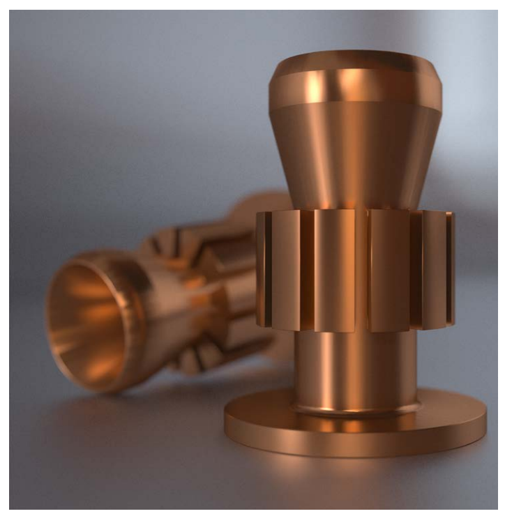
Not all thorium-free parts are created equal. We are confident you will agree ours are better!

Other suppliers have simply changed the tungsten in plasma gun parts to a thorium-free composition. While these parts comply with regulations, part performance is compromised and service life is reduced. As a result of extensive research and testing, Oerlikon Metco has changed both the tungsten composition and redesigned our parts to ensure performance comparable to the thoriated tungsten counterpart.