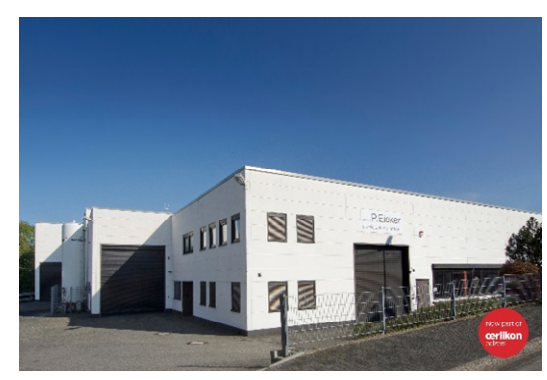
Oerlikon Balzers acquired Peter Eicker KG in Germany.