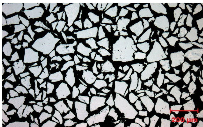
Photomicrographs of WOKA CTC. Top: Outer morphology showing irregularly shaped particles. Bottom: Inner structure.