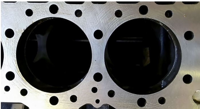
Engine deck restored with Metco 8293.

Please note that per the normal limitations of thickness gauges, such as an Elcometer, a maximum coating thickness of approximately 1500 µm (0.060 in) can be read.