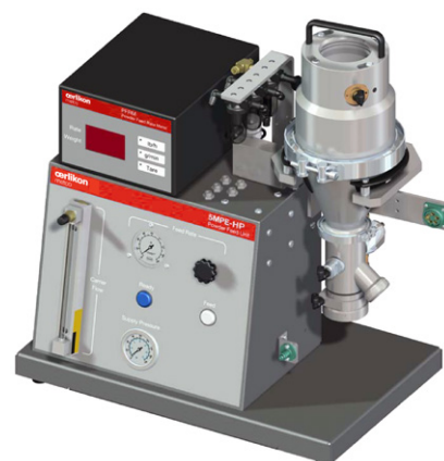
5MPE-HP – Standard Configuration (includes PFRM Powder Feed Rate Meter)