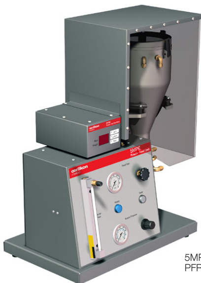
5MPE – Configuration with optional PFRM Powder Feed Rate Meter and PFRMW Wind Cover