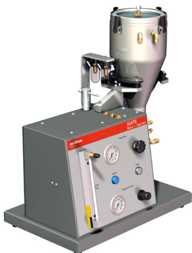
5MPE – Standard Configuration

The space-saving, tabletop design has a hopper that is simple to fill and clean out. Operation of the 5MPE is simple, using a precision rotameter to control carrier gas flow and easy to read and set pressure gages to control carrier gas flow and the rate of powder feed. Solid state electronics ensure dependable operation.