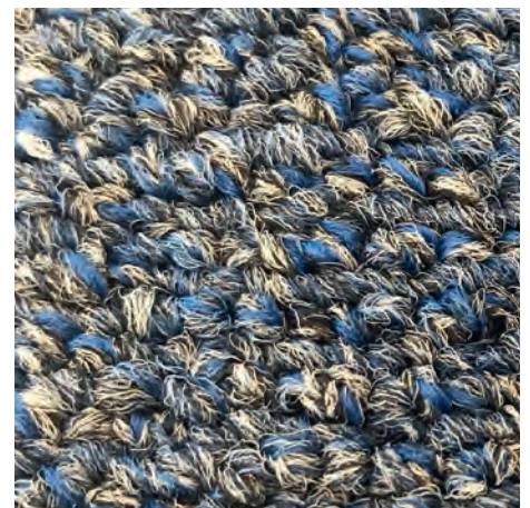
One color accentuated