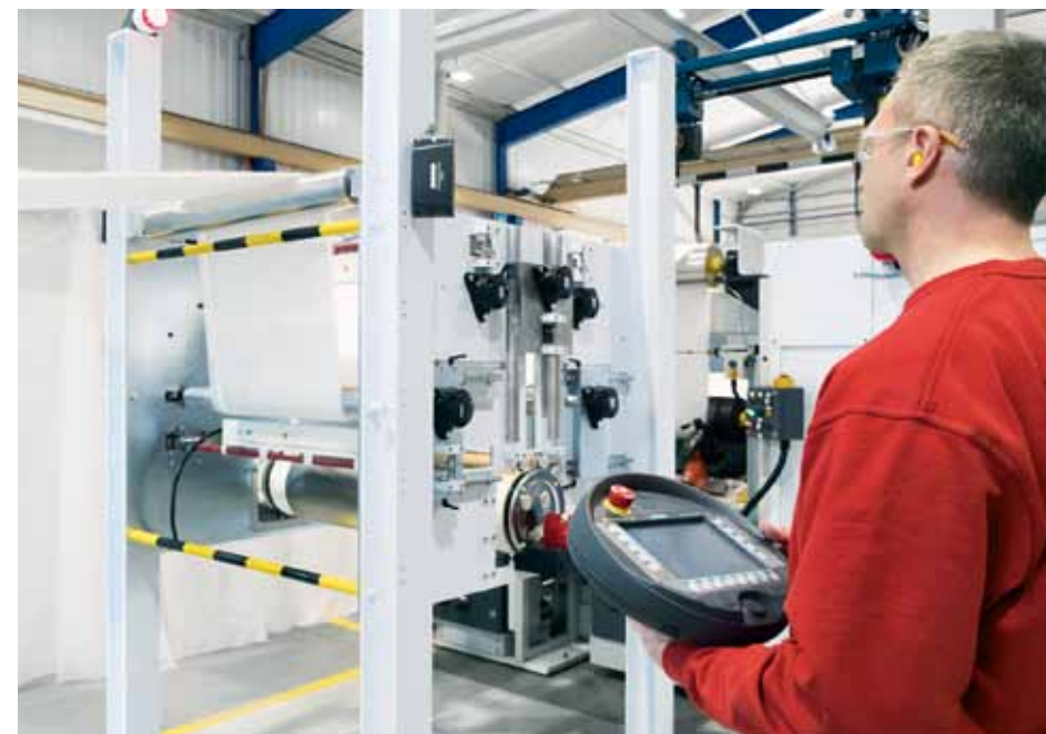
The Oerlikon Neumag electro-charging unit can be used to manufacture EPA- and HEPA-class filters.

Oerlikon Neumag meltblown technology is one of the most efficient methods for producing very fine and highly-separating filter media made from plastic fibers. Depending on the application, the pore size of a meltblown nonwoven material ranges from 5 to 40 µm. Here, smaller pores increase the mechanical filtration performance, albeit at the expense of higher pressure losses. The fineness of the meltblown fibers used for filter media lies in the 200- to 2,500-nm range. However, even fibers with nanoscale fineness are often not sufficient to separate the finest particles from air or liquid flows. Electrostatically charging filter media can significantly and inexpensively improve the filter performance without increasing the throughput resistance. (che)