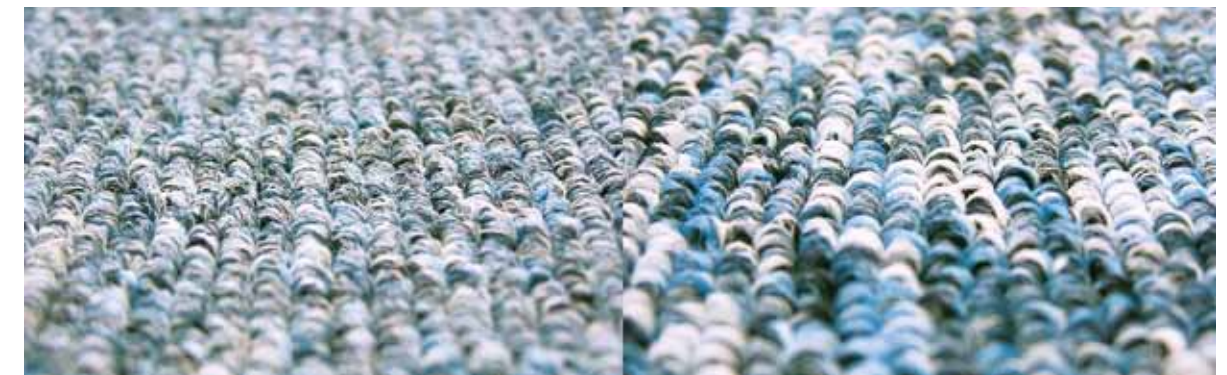
Get maximum flexibility from three colors with CPC – comparison of mélange and color pop carpet

Tricolor carpets must have a very uniform appearance, and an optimum tangle result in the BCF spinning system is crucial for this. These tangle knots are produced in defined spacings and tenacities using RoTac. Thanks to this tangling option, uniform tricolor results that cannot be achieved using conventional tangling units are produced even at high speeds. (che)