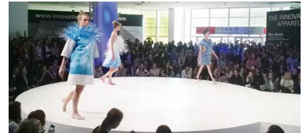
The 'Innovative Apparel Show' proved to be a veritable audience magnet.

And the Techtextil once again proved to be an important catalyst for exciting discussions with customers and partners. "Many of our industrial yarn and nonwovens manufacturing customers and the respective further processors were themselves exhibitors at the fair. This provided excellent opportunities