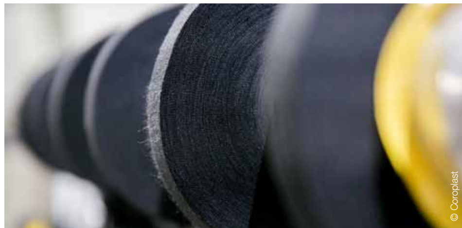
Fabric tape with dense and abrasion resistant cloth structure, easy to tear by hand – only one among the many special-purpose industrial adhesive tapes by Coroplast

Here, the unwinding force plays a huge role: in other words, how easy or difficult it is to unwind the adhesive tape. Because – depending on further processing, which is generally carried out manually – a precisely-defined unwinding force is required to simplify handling for personnel and to cut production time – particularly in the automobile industry. And the flexibility of the textile material also supports this simplification during assembly.