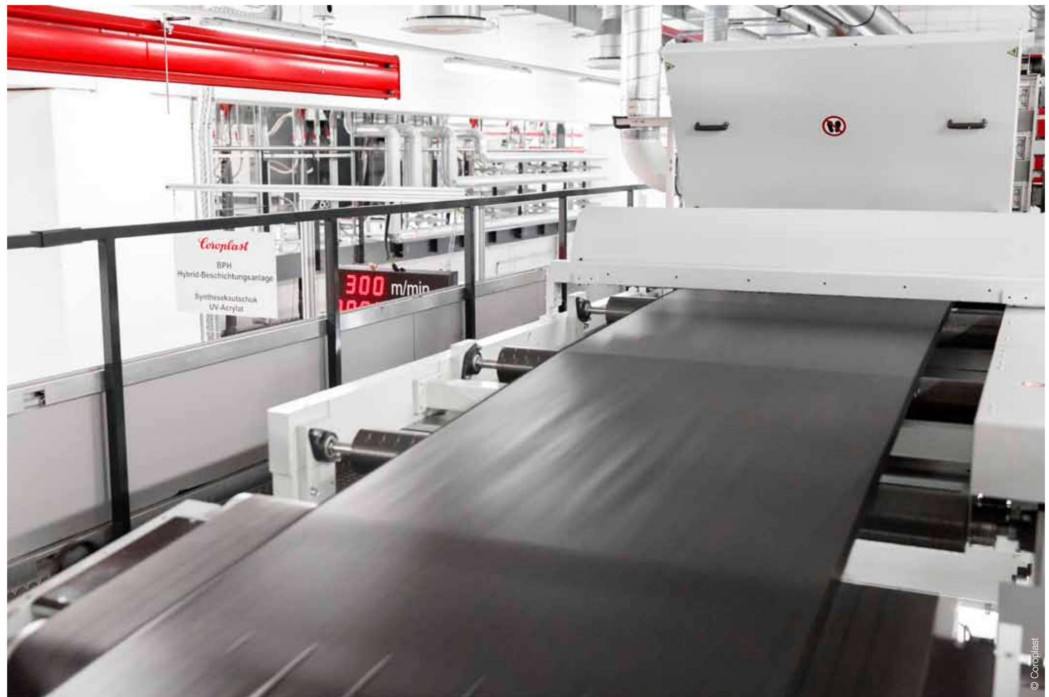
Combines deep engineering expertise and decades of experience with industrial tape technology at Coroplast: the self-developed, highly innovative tape coating machine "BPH"

Here, the unwinding force plays a huge role: in other words, how easy or difficult it is to unwind the adhesive tape.