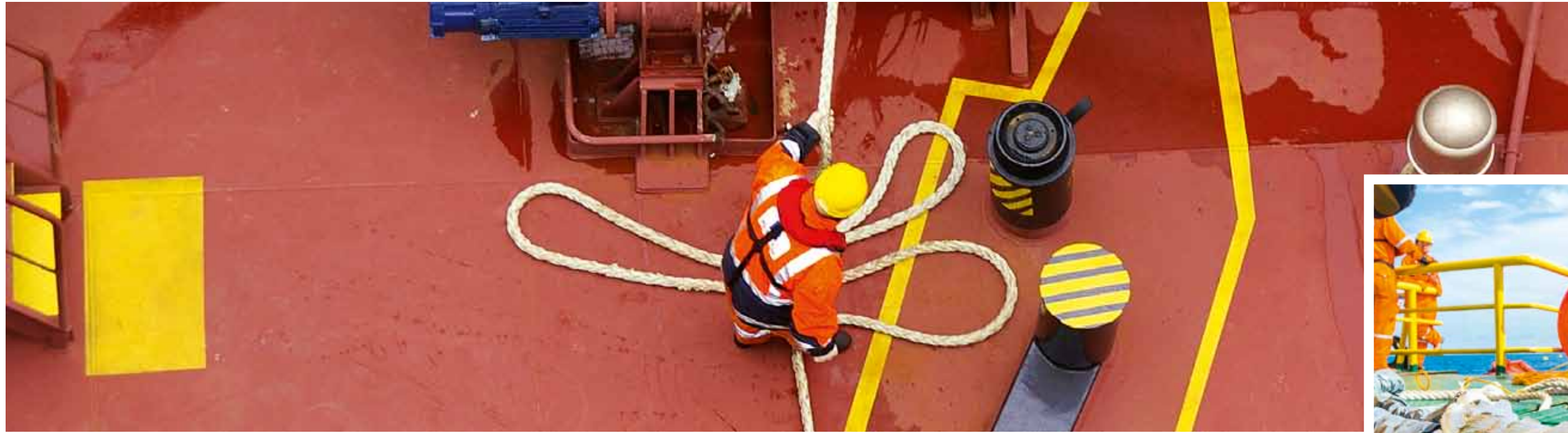
A single Floating Production Storage Offloading (FPSO) platform requires at least 2,000 metric tons of yarn.