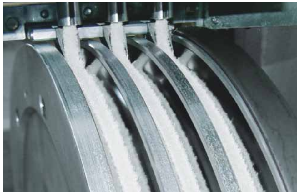
Straight depositing on the cooling drum guarantees highest crimp quality.

According to PCI Redbook, just under 90,000 metric tons of additional capacity have been installed for the production of melt-dyed and raw white PA6 yarns over the last five years. Oerlikon Neumag's share of these capacities totals approx. 65%. And the trend towards high-end, fine single-titer PA6 BCF yarns continues unabated. The melt lines, specially optimized for this process, ensure optimum melt quality. A depositing shoe on the texturing unit especially developed for this and a so-called 'V' cooling drum guarantee the highest degree of crimp evenness and quality. And the specially-designed texturing components cater to the very highest demands when it comes to short-pile automotive applications. (che)