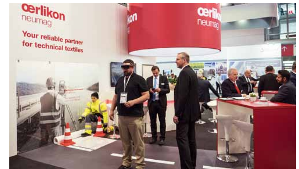
Visitors to the Oerlikon Manmade Fibers stand showed great interest in the digital concepts and Industrie 4.0 solutions.