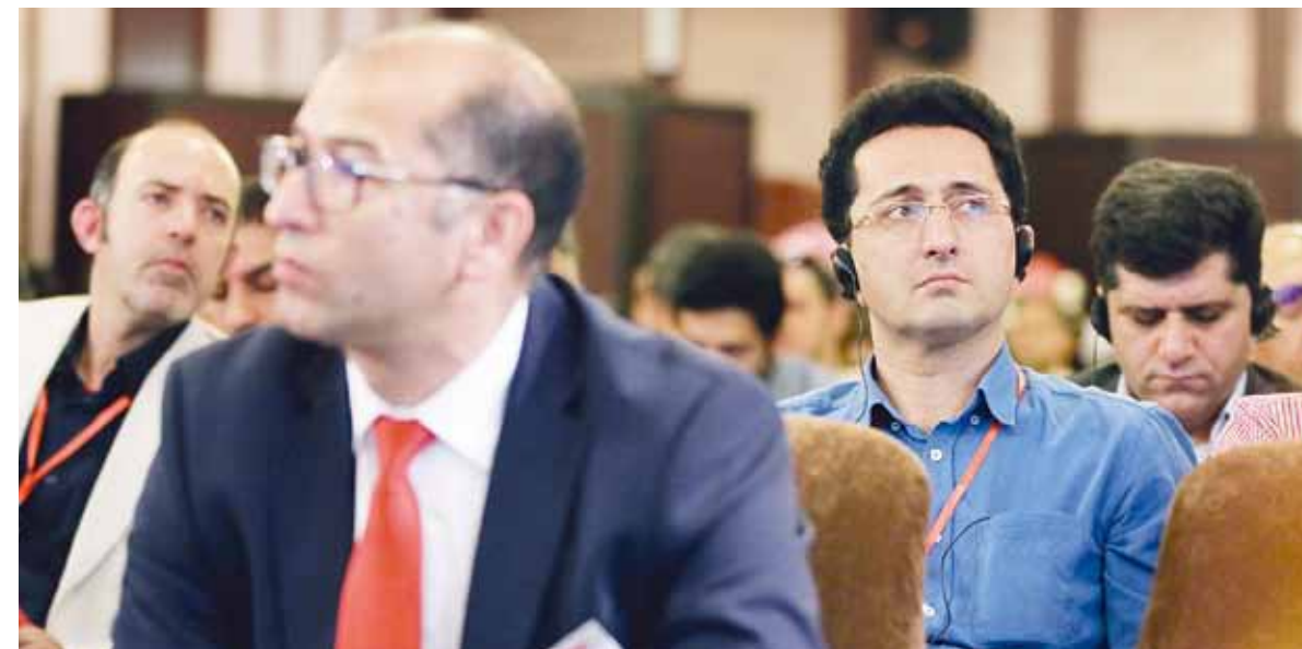
The symposium was well attended by the Iranian textile industry.

the eAFK HQ – the latest automatic Oerlikon Barmag texturing machine with a total of 576 positions – to the world; triggering murmurs throughout the room and subsequently resounding applause.